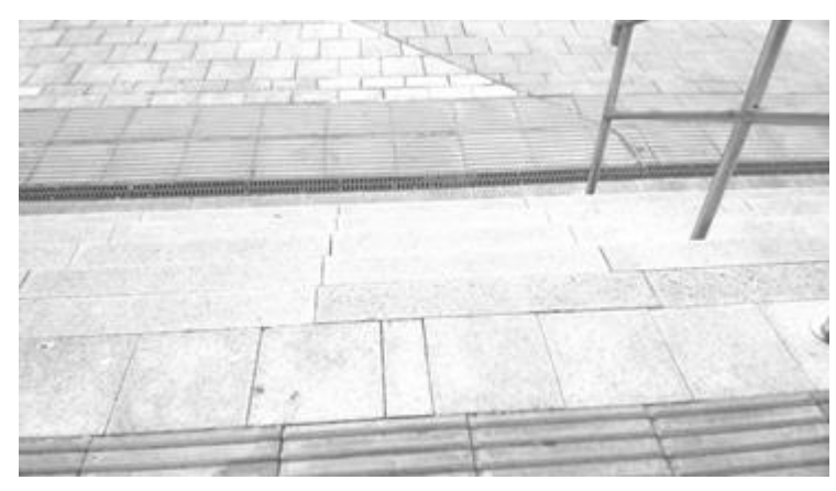
Photo taken in black and white demonstrates no contrast between steps giving the illusion of a 'slope' to a visually impaired person.

Steps & stairs require slip-resistant edge marking in a contrasting colour. Marking should extend the full width of the step, be 55mm wide on the edge of the tread & top of the riser and comply with all relevant standards/guidance e.g. Equalities Act, Approved Documents and British Standards. A permanent solution e.g. self-coloured slip-resistant GRP is preferable to paint as it is more durable and reduces the need for on-going maintenance.